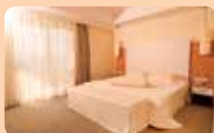
Corner suite 9