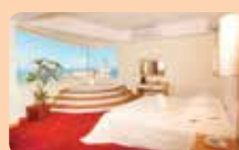
Deluxe room 8