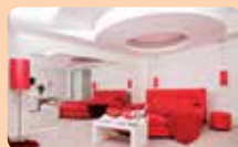
Reddoor 10 Honeymoon room