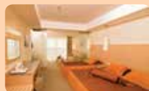
Superior room 80