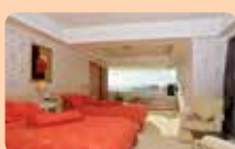
Presidential suite 1