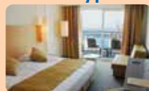
Standart room 351 Disabled room 4