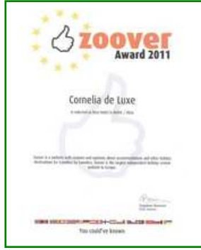
ZOOVER – BEST HOTEL BELEK