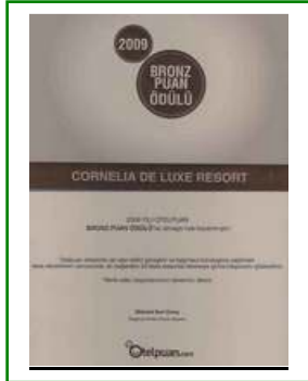
OTEL PUAN – BRONZE AWARD