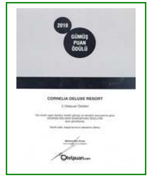
OTEL PUAN – SILVER AWARD