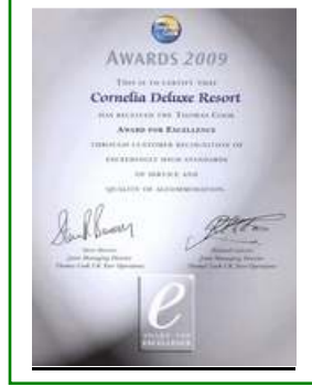
THOMAS COOK - AWARDS for EXCELLENCE