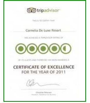
TRIPADVISOR – CERTIFICATE OF EXCELLENCE