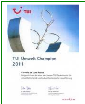
TUI – UMWELT CHAMPION