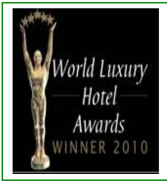
BEST LUXURY COASTAL HOTEL