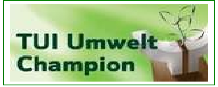
TUI – Environmentally Friendly TOP 100 Hotels Worldwide