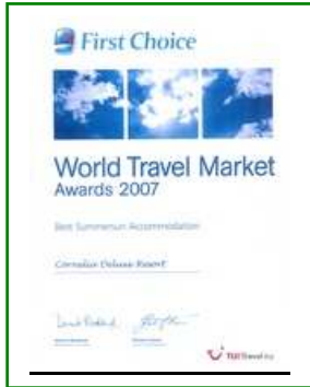
FIRST CHOICE – WORLD TRAVEL MARKET AWARDS