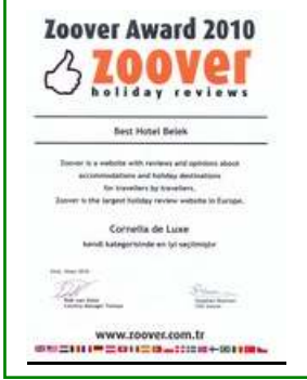
ZOOVER – BEST HOTEL BELEK