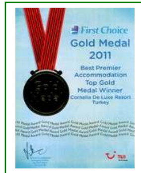
FIRST CHOICE – TOP GOLD MEDAL