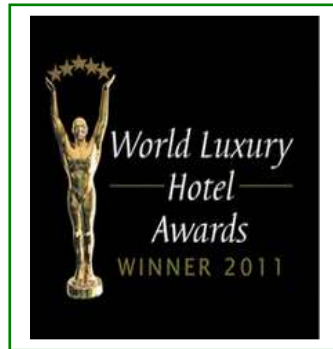
BEST LUXURY COASTAL RESORT