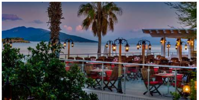
NAR KEBAP RESTAURANT