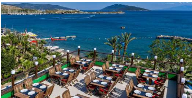
LA LUCENTE RESTAURANT