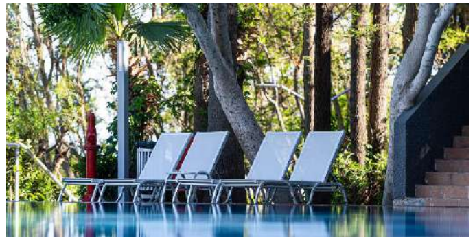
One outdoor pool (sun bed + mattress) Depth 1.40 cm.