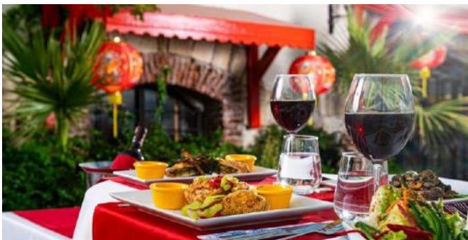
SENDO CHINESE RESTAURANT