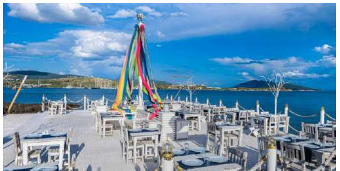
FENER FISH RESTAURANT